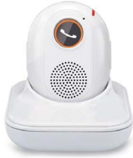
INSTRUCTION MANUAL P/N XXXXX (D,Z)